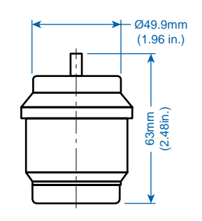
For DV fuses, please consult Altech.