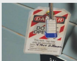
Lock out-tag out