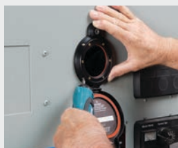
Attach and secure cover